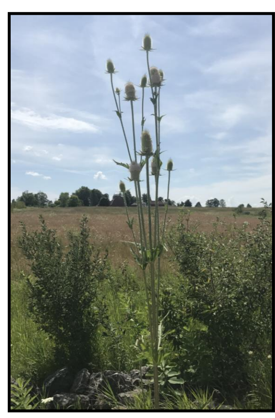
Cut-leaf Teasel in flower near Ellison Bay.

Projects eligible for cost share funding must have a definite probability of significantly reducing the priority invasive species. Priority will be provided to first time applicants with no more than five municipalities selected in a calendar year. SWCD municipal cost sharing shall not exceed 50% of the total costs for the treatment of the invasive species. Municipalities may apply for the cost share funds at the SWCD office by completing and submitting a short proposal of the priority invasive species control program and a Request of Municipal Cost Share form. For more information, contact Krista Lutzke at the Door County Soil and Water Conservation Department at 920-746-2363 or klutzke@co.door.wi.us.