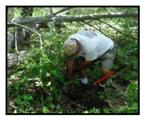
Rushes volunteer works to remove Japanese barberry in 2016.

The Rushes Wilderness Foundation will be holding spring workdays on The Rushes property near Kangaroo Lake, working on activities such as invasive species control, trail maintenance, and tree care. The workdays will be May 1, 2, & 3 (Tues, Wed, and Thurs) and May 29, 30, & 31 (Tues, Wed, and Thurs). Those interested in volunteering can pick one, two, or all three of the days to help. The workdays will begin at around 9:00am and will last until 5:00pm on Tuesdays and Wednesdays, and 9:00am to noon on Thursday. Lunch will be provided and wine, beer, soda, cheese, etc. after work on the first and second days. If you'd like to volunteer or need lodging information, contact Margaret Pagels at <a href="margaret@therushes.com">margaret@therushes.com</a> or 920-839-2730.